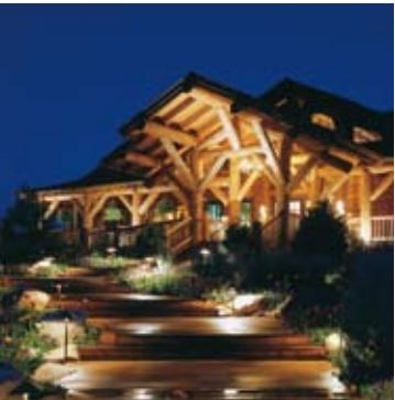
Evening at the Clubhouse (below top), and the dining room (below bottom).