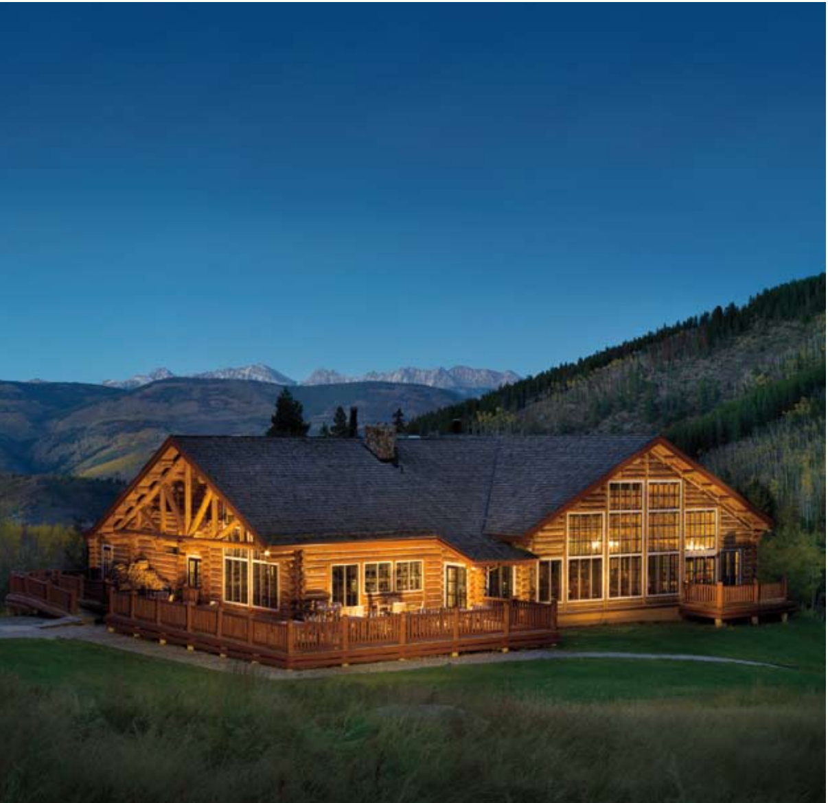
Beano's Cabin at dusk (left). Evening celebrations (below top). The dining area will be set up to fit your party (below bottom).

For availability and reservations, please call (970) 754 5762.