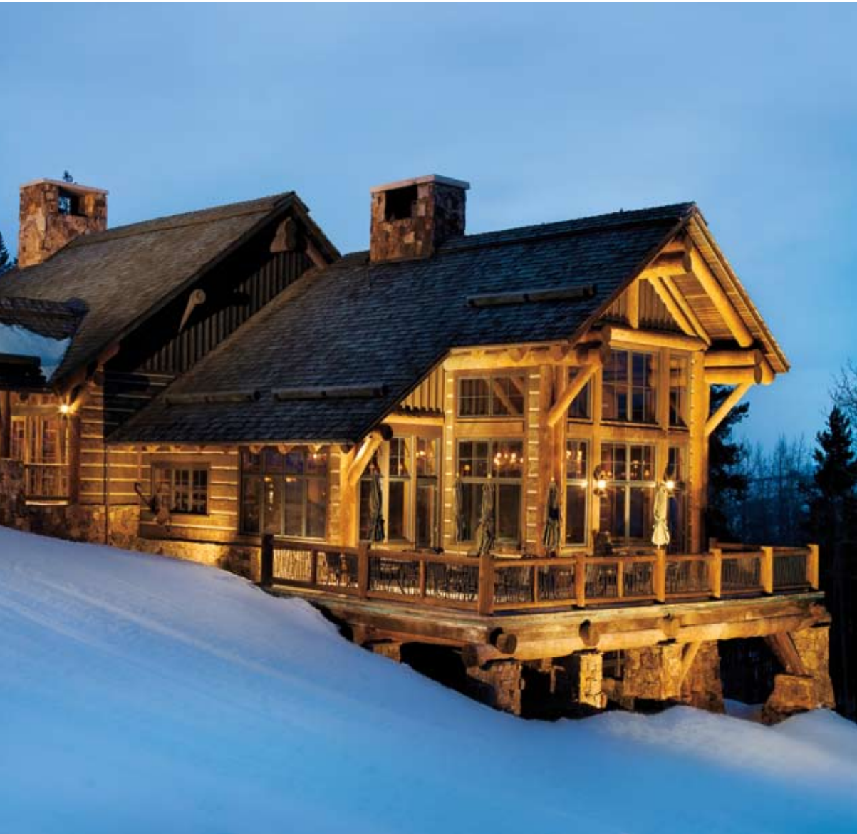
The grandeur of the mountains is captured at Zach's Cabin (left).

For availability and reservations, please call (970) 754 5762.