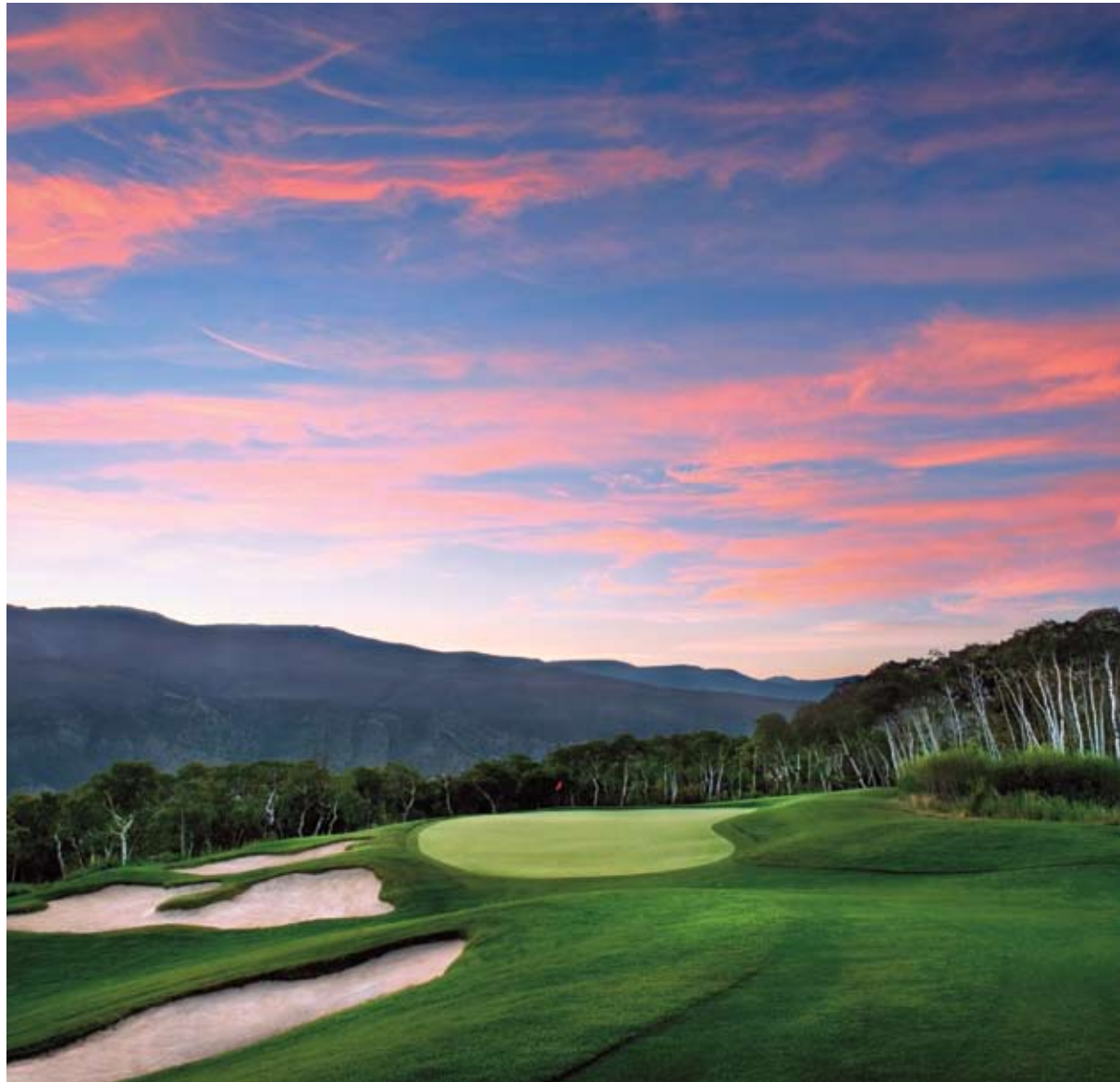
Sunset on Fazio Golf Course (left).