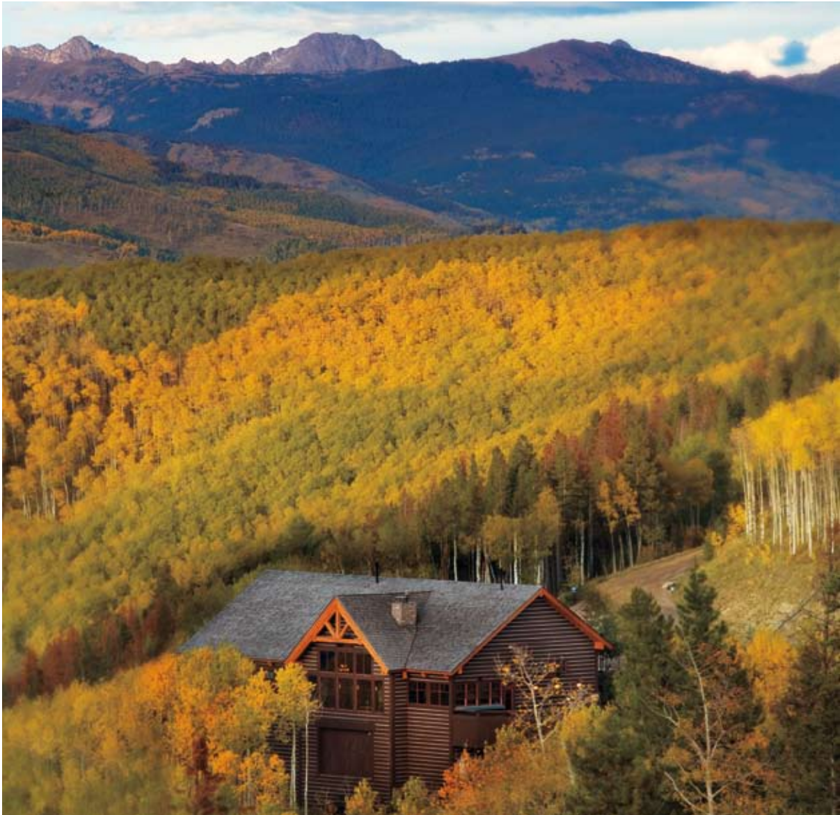
A carpet of aspens, from Allie's Cabin to the Gore Range (left). Arrive by sleigh. The perfect venue to watch an evening fireworks display (below top). A cozy bar, a grand dining room (below bottom).