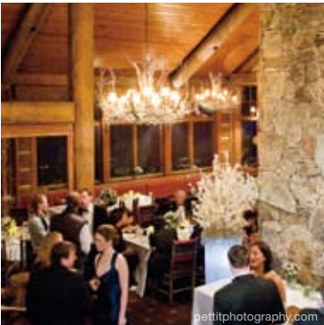
Two views of the main level (below).