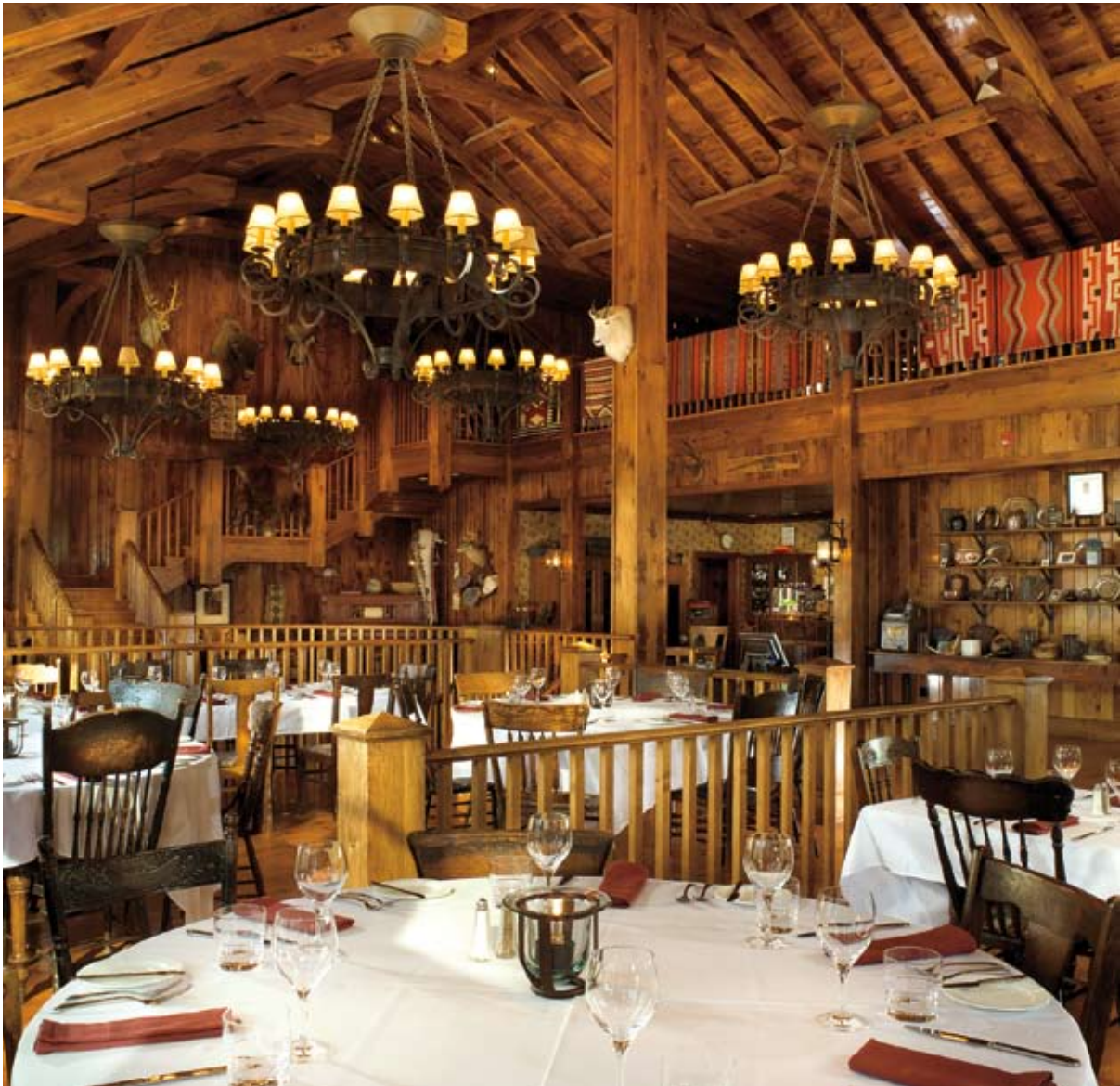
The Clubhouse at SaddleRidge (left).